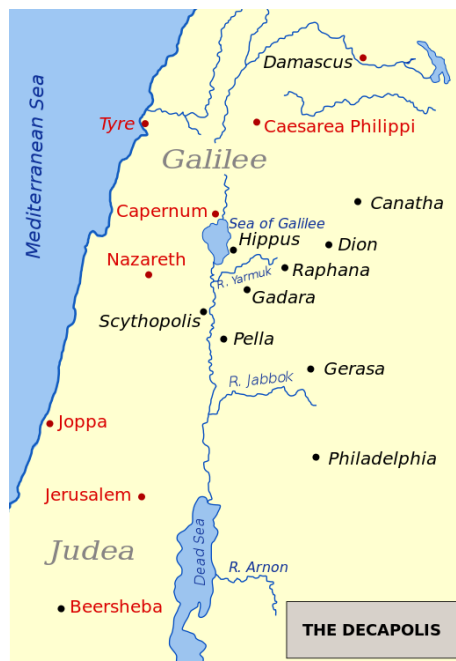
Decapolis region and its surroundings in the 1st century

According to other sources, there may have been as many as eighteen or nineteen Graeco-Roman cities counted as part of the Decapolis. For example, Abila is very often cited as belonging to the group.